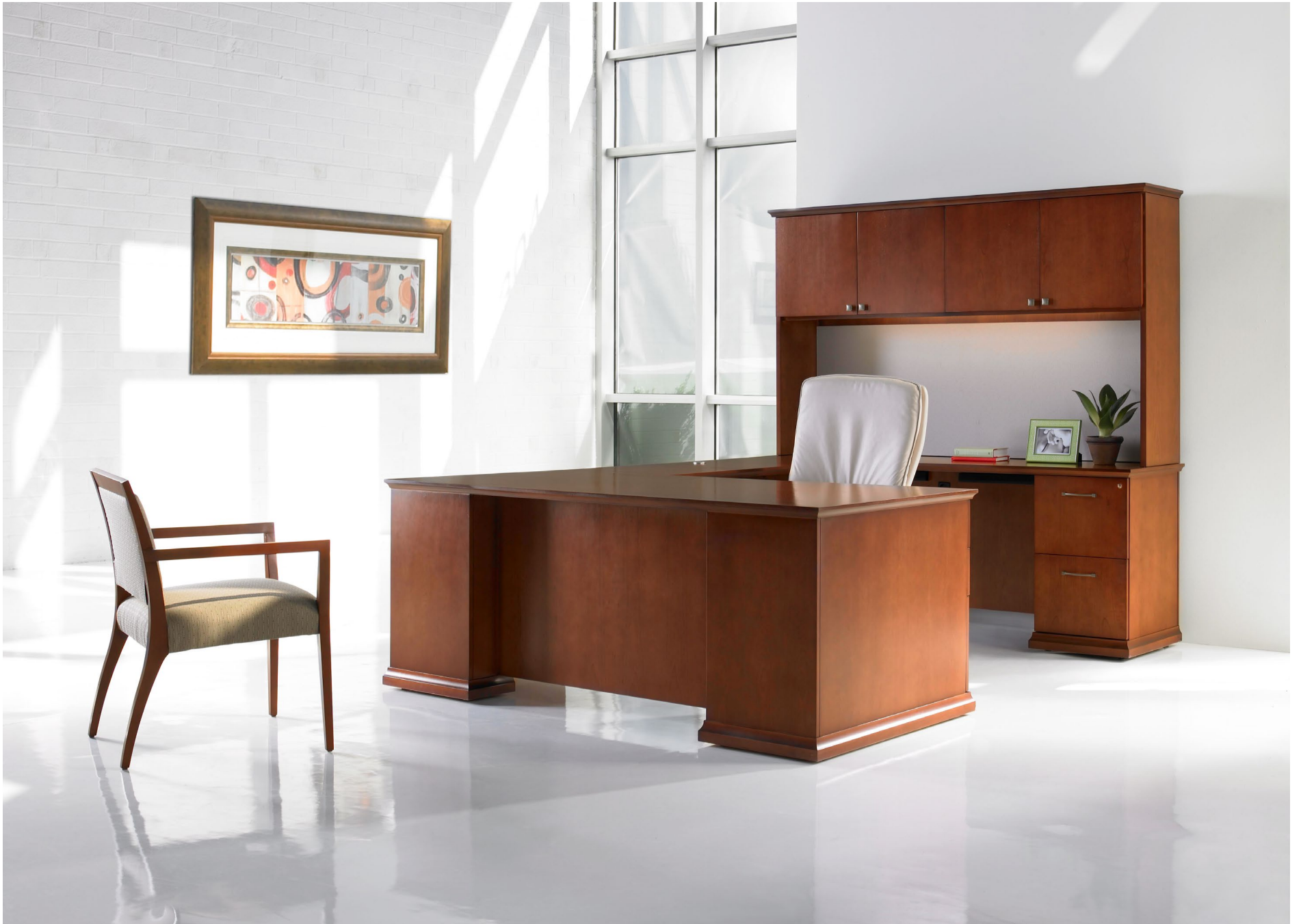
Tops crafted with hardwood profile edge, base and door frames